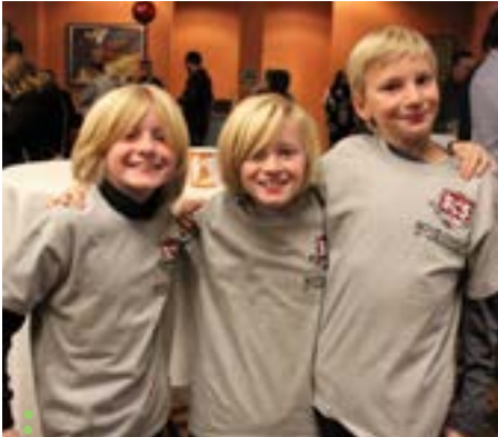
• A few members of the Boys Choir of Springfield enjoying the Isabel's Tree Lighting Ceremony.

Last year, Isabel's House provided 24/7 care to over 300 children from over 140 families who were facing a difficult crisis here in the Ozarks - ranging from homelessness and unsafe housing to domestic violence, medical emergencies, and overwhelming stress. Your efforts to light Isabel's Tree helped us meet the essential needs for over 20 of those children. Your light changes lives, promotes strong, stable families, and helps ensure brighter futures for every child in our community.