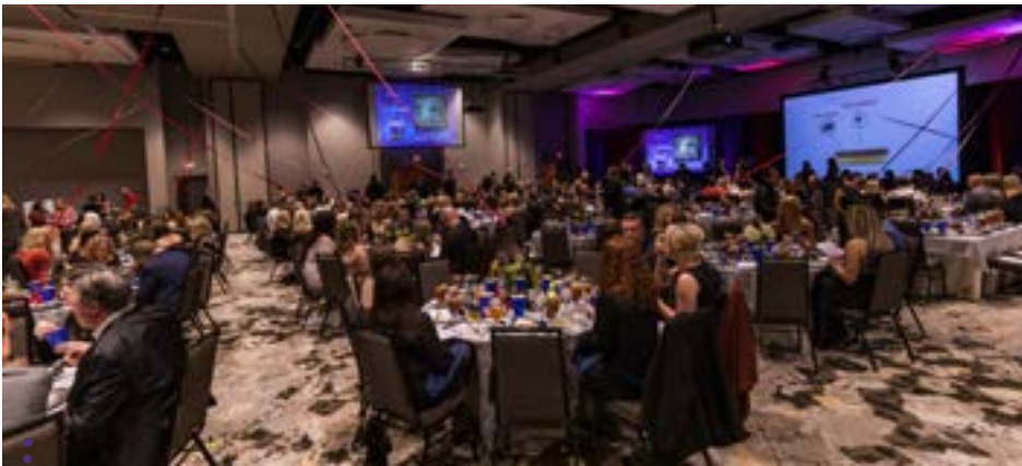
The new Double Tree Conference Room - The Glendalough

Thank you for helping us raise over $200,000 in life-saving funds for the children and families of Isabel's House!