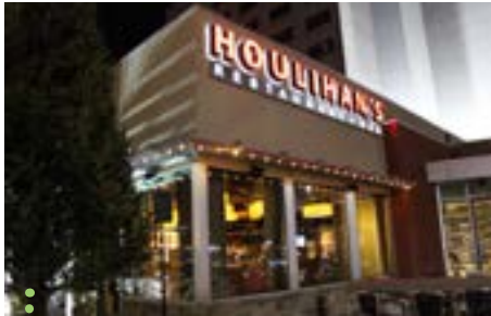
• Houlihan's North, the location of Isabel's Tree and the annual lighting ceremony.