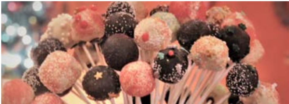
• Tasty treats from Santa's Sweet Shoppe, donated by the OTC Culinary Arts and Hospitality Management Department.