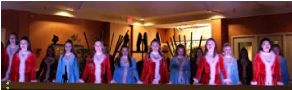
• The Glendale High School Crimson Girls putting on a holiday themed routine for the audience.